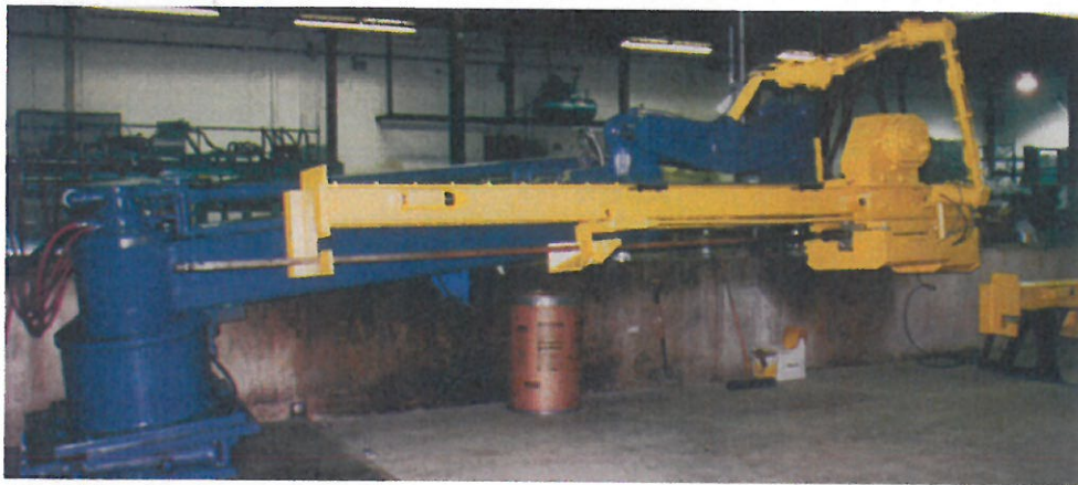
Blast Furnace Tap Hole Drill

Designed and built according to engineer's specifications.