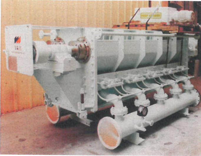
Adjustable Venturi for the Steelmaking Industry

Kasunick Manufacturing Inc. Combining experience with the latest equipment to provide the best quality for you