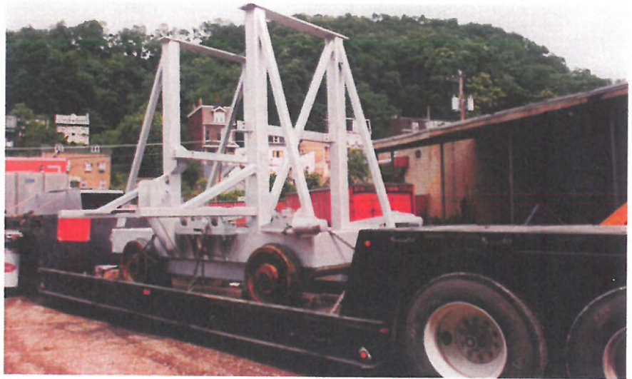
Coke Oven Guide Transfer Car Ready for Delivery

Kasunick Welding Co. Industrial Equipment Division trucks are scheduled anywhere in the United States to assure quick turnovers and on-time deliveries.