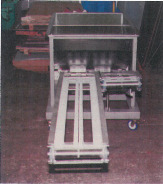
Food Handling Hopper and Conveyor

Manufacturing the highest quality products and equipment for the food, pharmaceutical and chemicals industry.