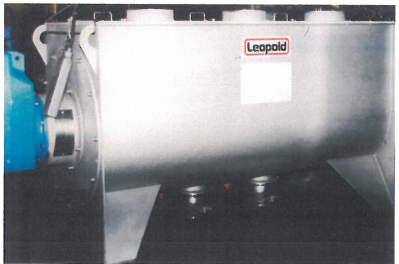
Stainless Steel Blender