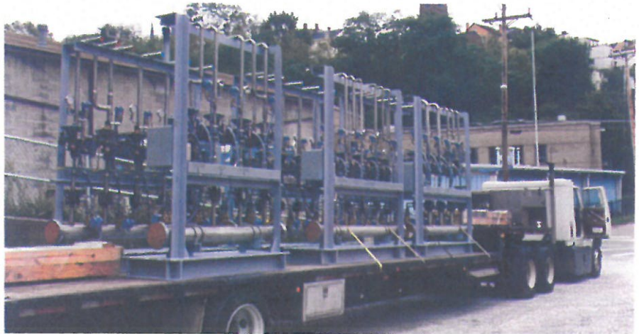
Stainless Steel Piping Skids Ready for Delivery

Kasunick Welding trucks are scheduled anywhere in the United States to assure quick turnovers and on-time deliveries.